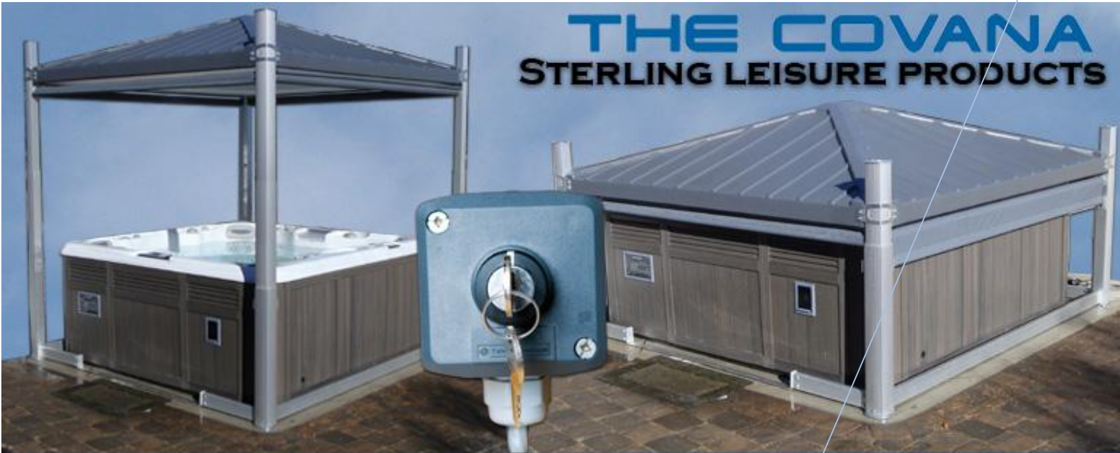
The World's First and Only Fully Automated Spa Cover / Gazebo